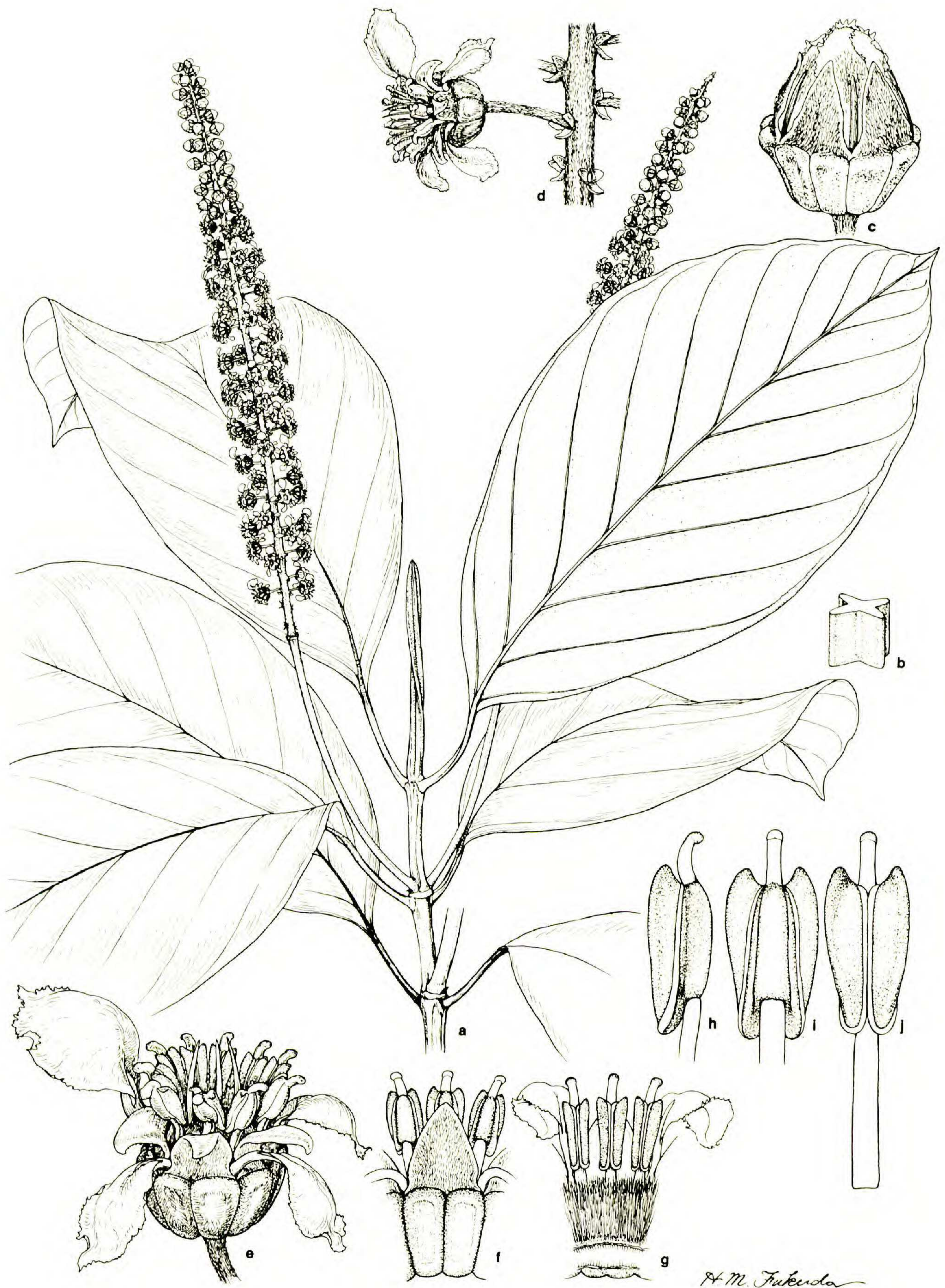
FIG. 2. Acmanthera cowanii : a, habit, \times 0.5 ; b, stipular sheath in cross-section, \times 2 ; c, opening flower bud, \times 5 ; d, flower, \times 2.5 ; e, flower, \times 5 ; f, sepal and stamens, dorsal view, \times 5 ; g, stamens, ventral view with ovary removed, \times 5 ; h-j, anthers in lateral (h), dorsal (i), and ventral (j) views, \times 10 . (Drawn from Cowan 38597.)